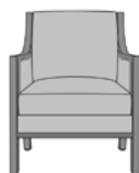
LUCA1A1 27.5W 37D 36H 25AH