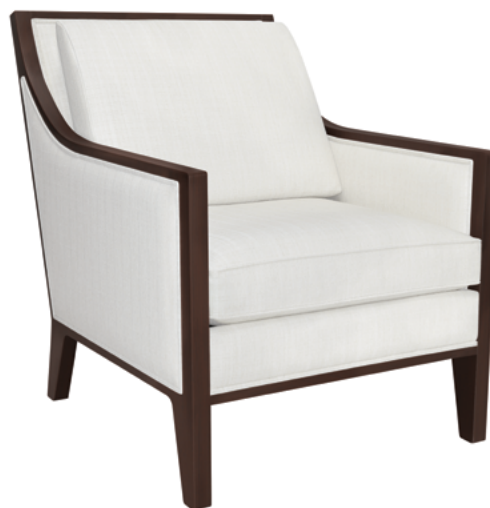
Model: LUCA1A1 27.5W 37D 36H 22SW 20SD 19SH 25AH

Kwalu's Lucca Lounge collection maintains the cool vibe of the mid-century modern style with added comfort and flair. Included in the collection are a lounge chair and a love seat, featuring double piping, standard on the inner and outer arm, the inner and outer back and along the front seat rail. The back pillow provides superior comfort that supports and envelopes the user.